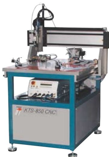
KTS-850 CNC coordinate table without casing